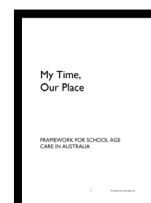
My Time, Our Place; Framework for School Age Care in Australia